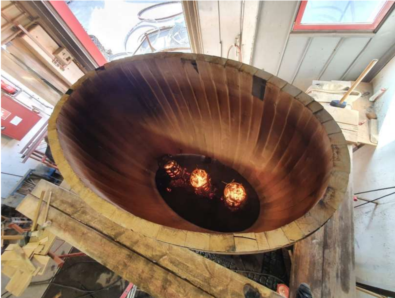
FASSHERSTELLUNG (80hl) DURCH PAUSCHA IN TRADITIONELLER MANIER MIT FEUER