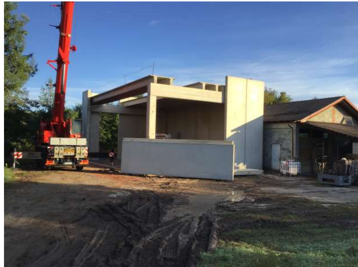
BAU DES MAGAZINS UND RENOVATION AGRICENTRE