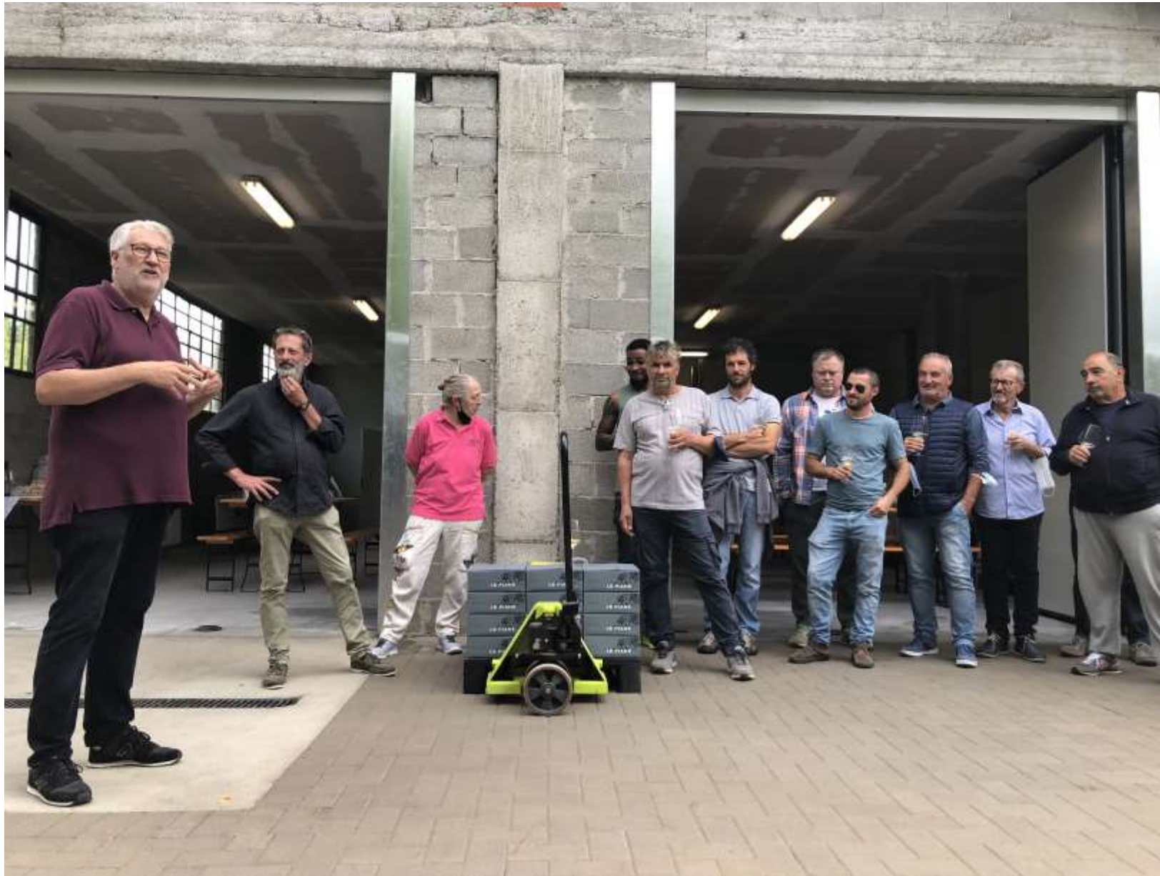
Eröffnung neues AGRICENTRE 2021