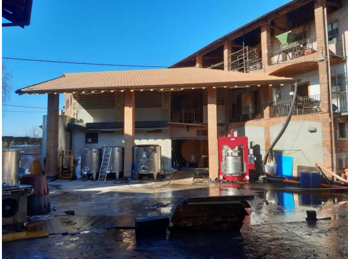
AUSSENSICHT DES RENOVIIERTEN KELLERS